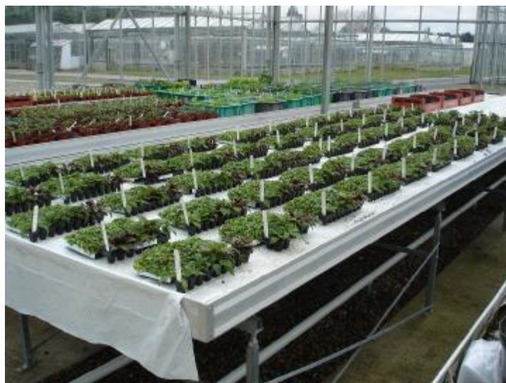
Plate 1 : Layout of crop safety trial at STC with seed raised I. walleriana 'DeZire Mix Select' and cutting raised I. hawkeri 'Harmony Series'.