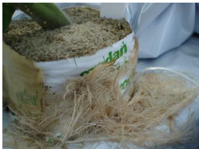
Root-mat symptoms on a tomato plant artificially inoculated 4 weeks post-sowing.

We have also completed the 3 year investigation into the control of root-mat in tomatoes. We have carried out this work in collaboration with ADAS and CSL. We have been somewhat hampered by the poor symptom development in commercial crops in the UK during the last 2 years of this project. This has resulted in us not being able to draw many firm conclusions as to the efficacy of some of the methods e.g. slow sand filtration and the use of microbial bio-control products. These were trialled on 2 commercial nurseries which had previously seen a high incidence of root-mat on their nurseries. Good symptom development was seen in a glasshouse experiment carried out at STC in the final year of the project (see image below). The results suggest that for aggressive symptom development plants need to be infected when very young e.g. particularly during propagation. Where plants were inoculated later infection levels were lower or absent. This information could prove to be very important to help control this problem in future seasons. The final report will be available on the web site in the very near future.